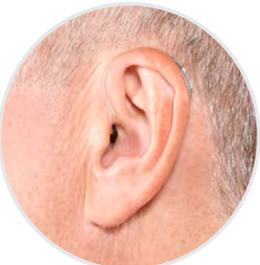
The TruLink Hearing Control app, partnered with Halo iQ, is easy and intuitive to use with iPhone and select Android devices.