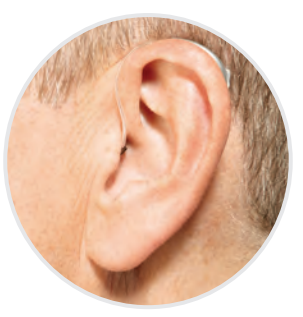
Muse iQ is available in a variety of styles and colors for your ideal fit.