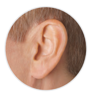
SoundLens Synergy iQ hearing aids fit deep inside your ear canal.